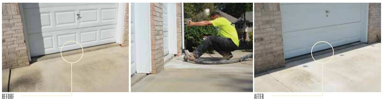
BEFORE The concrete is unsightly & a dangerous trip hazard.

We drill 2" holes through a slab of concrete and insert a grout combination. When all voided areas are filled, the injection mix "raises" the slab to the desired height. The area is then "broom cleaned" and core holes are repaired to produce a smooth, level surface. This procedure can be completed in a matter of hours with minimal disruption to normal traffic areas.